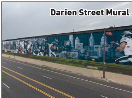
Darien Street Mural