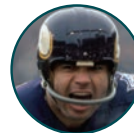
JOE KAPP 9/28/69 vs. Bal.