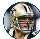
DREW BREEES 11/1/15 vs. NYG