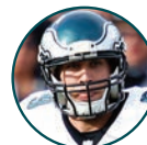
NICK FOLES 11/3/13 at Oak.