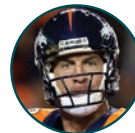
PEYTON MANNING 9/5/13 vs. Bal.