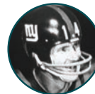
Y.A. TITTLE 10/28/62 vs. Was.