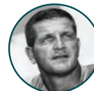
GEORGE BLANDA 11/19/61 vs. NYT