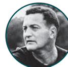
SID LUCKMAN 11/43/43 at NYG