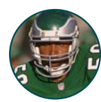
SETH JOYNER 6.5 & 3 INT (1991)