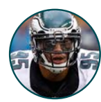
MYCHAL KENDRICKS 4.0 & 3 INT (2013)